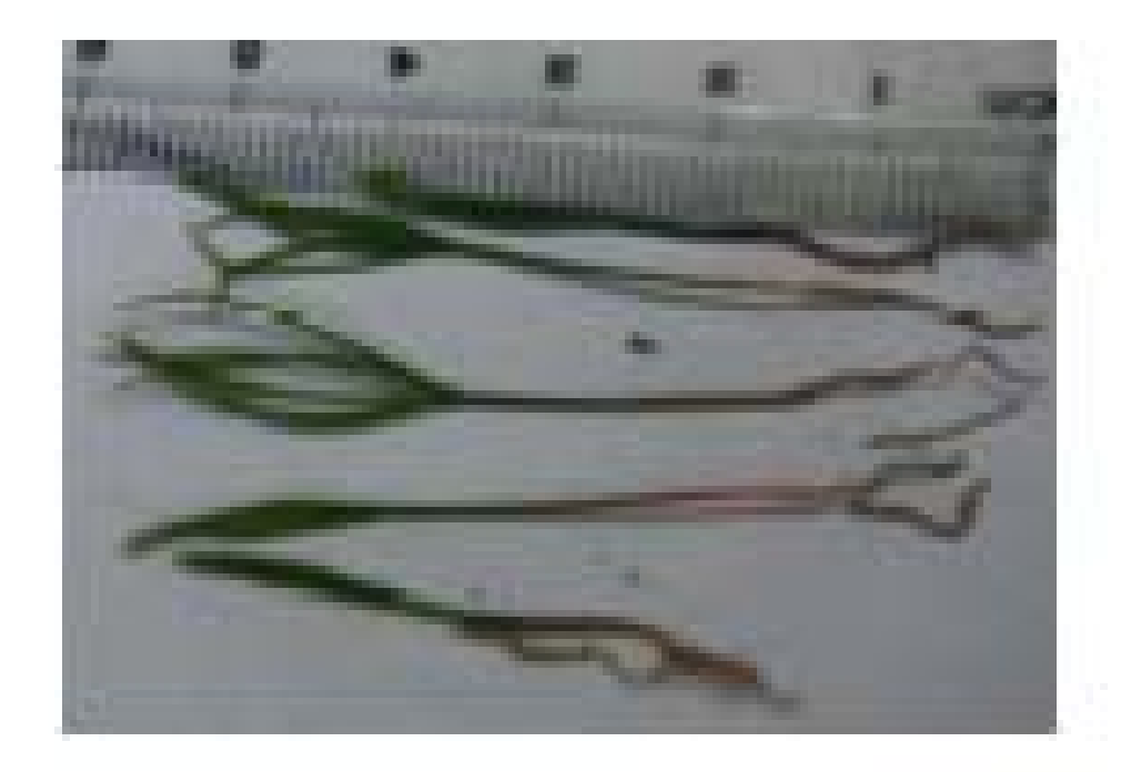
Figure 7 Natural regeneration in Mongolian pine plantations stands (No seedlings were more than one year old. The roots were less than 5 cm)

Figure is of very poor quality, and impossibly low resolution. And what does it tell us anyway?